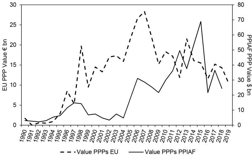
Fig. 6.1 Value of PPP projects in the European Union and in developing countries